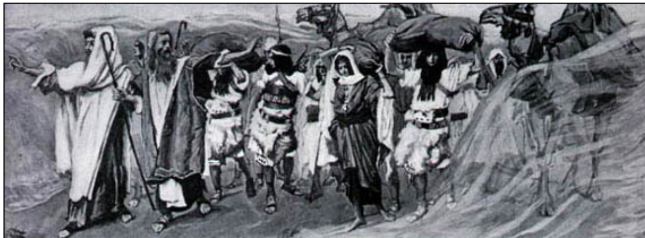
Crossing of the Red Sea by Francois Tissot