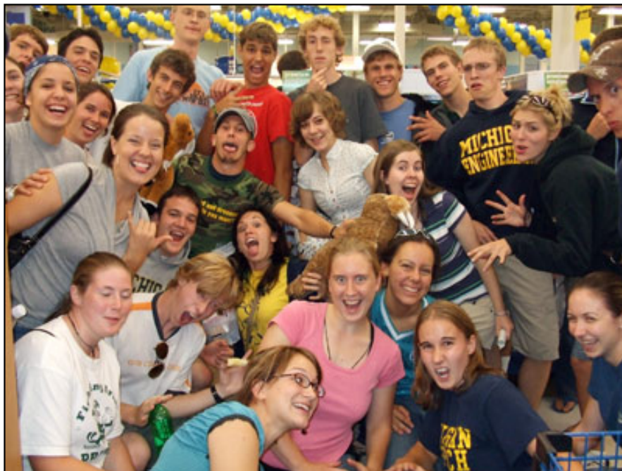
A group of university students enjoying a light moment during a UCO dormtroopers event.