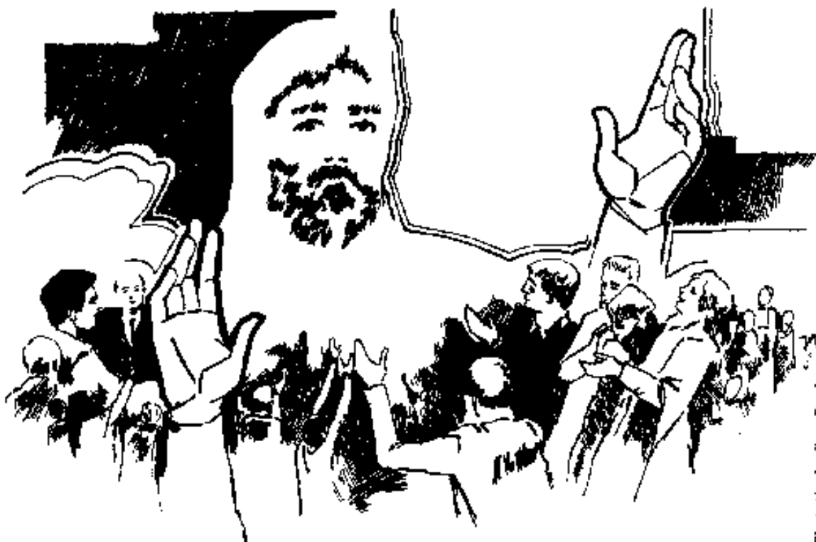
Illustration by Gerry Rauch