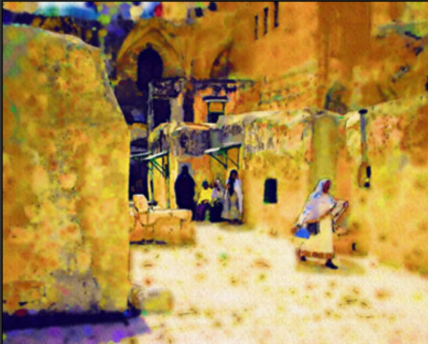
Ethiopean Copts at mid-day prayers - Church of the Holy Sepulchre - Jerusalem photographic image converted to digital watercolor

This scene was photographed in the bright mid-day sun on the rooftop of the Church of the Holy Sepulchre in Jerusalem. I enhanced the colors and texture to reveal the inner radiance and beauty of this holy place, revered by many Christians as the place where Christ died and rose to new life from the tomb on the third day - just as he had prophesied.