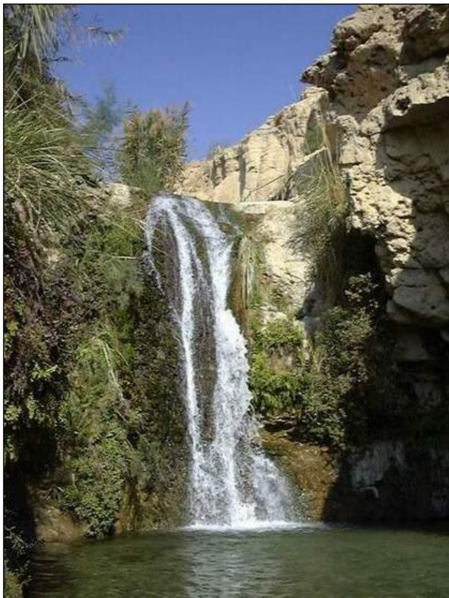
Pool of Nahal David at Ein Gedi, Israel