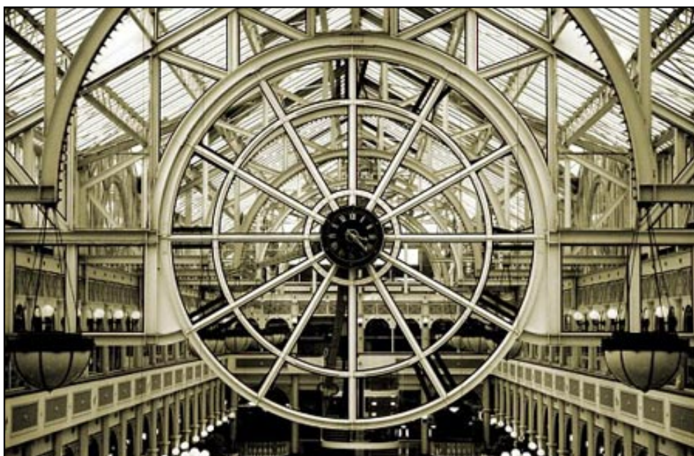
Belfast train station

Belfast is known throughout the world for “the troubles”. For decades, Protestant-Catholic sectarian strife has plagued Northern Ireland, but during that time The Sword of the Spirit in the region has sustained Charis , a community with people from both sides of the political and religious divide who are working to extend the way of peace in their own lives and to pass it on to others, especially the young. Personal conversion, cross-community activities, and taking concern for people on “the other side” characterize Charis.