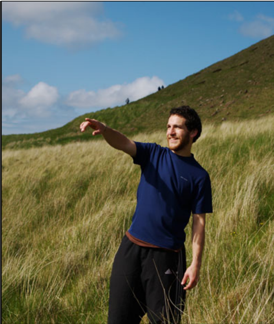
Climbing the hills of Glenariff along the North Antrim coast of Northern Ireland