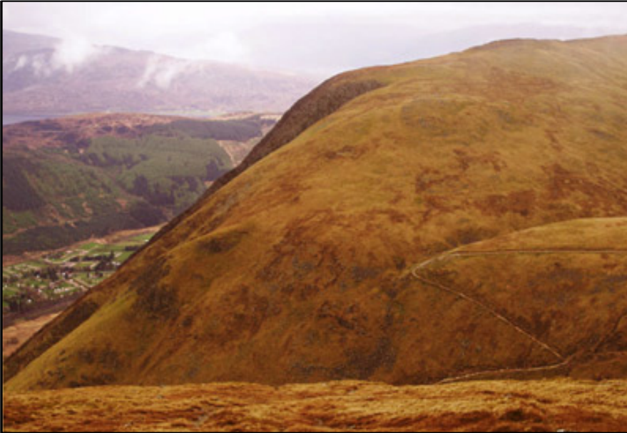
Ben Nevis in the Highlands of Scotland