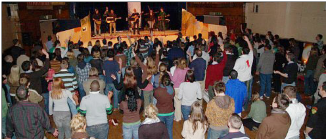
Charis Community hosted the recent European Kairos Conference