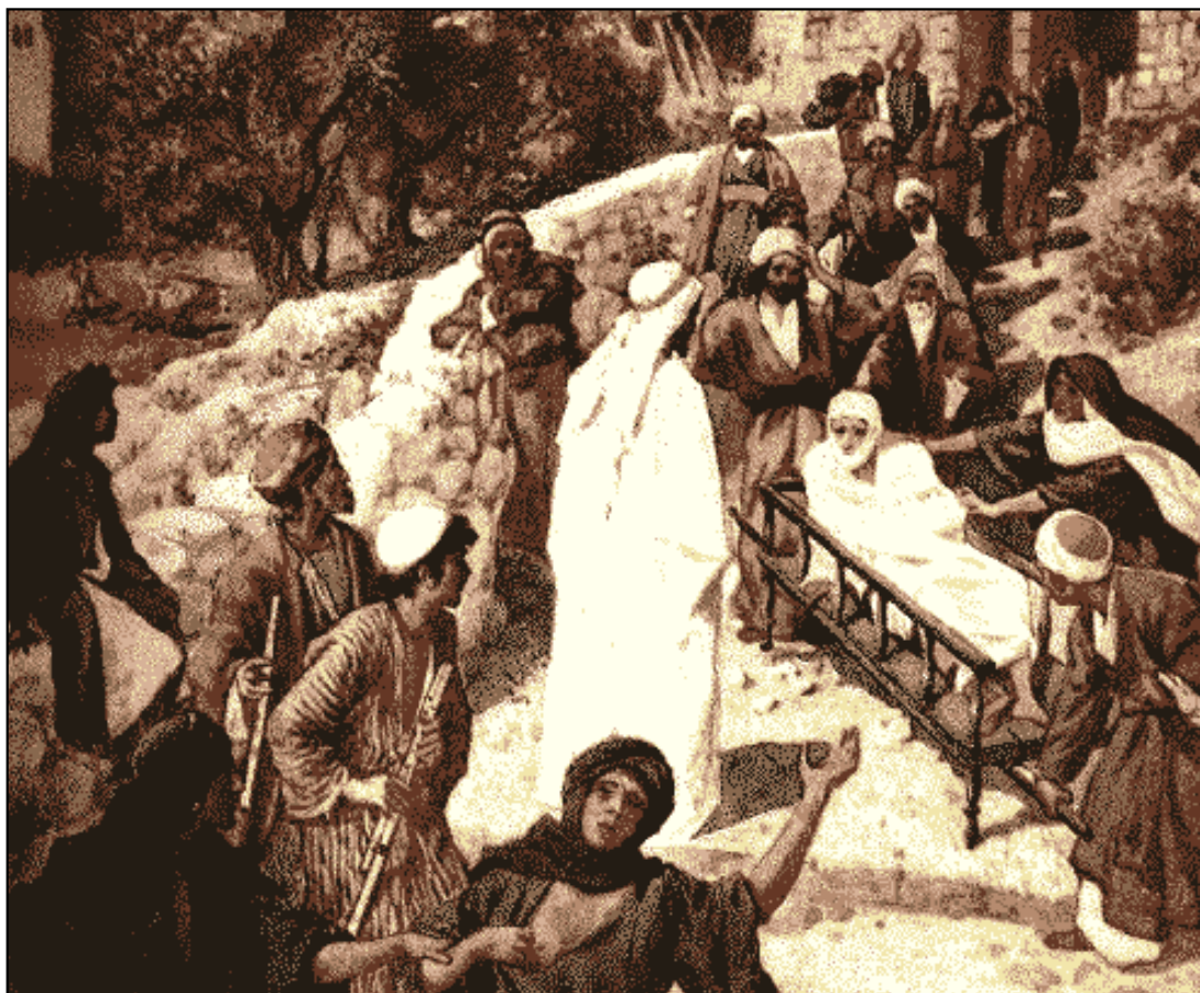
The widow's son at Nain rising to life - by William Hole