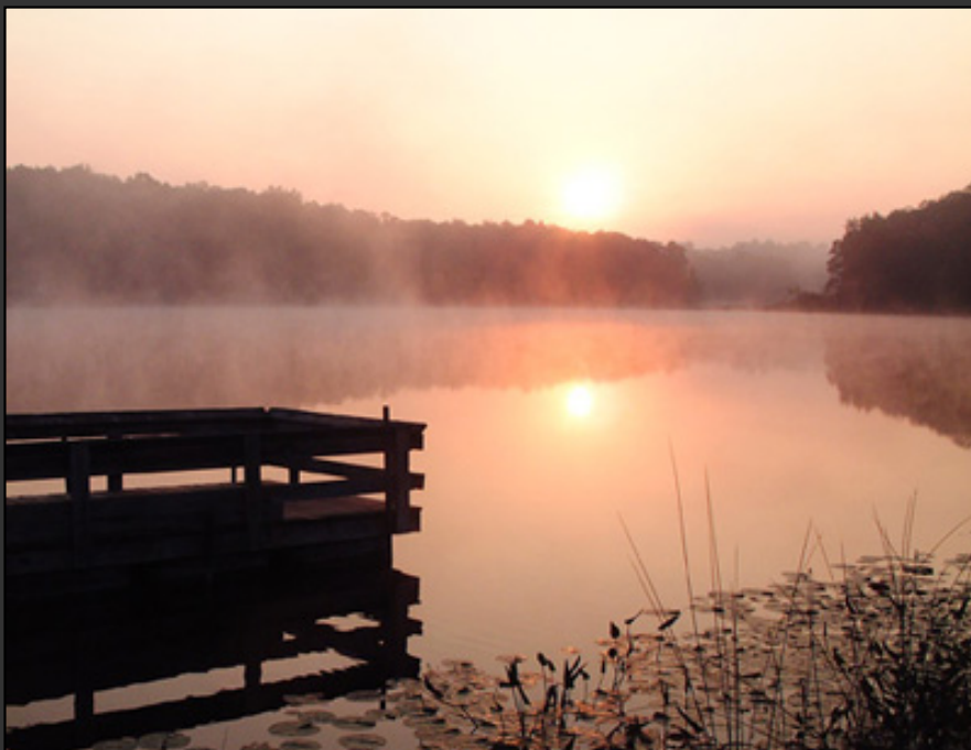
Misty sunrise reflection - lake near Pinckney, Michigan, USA