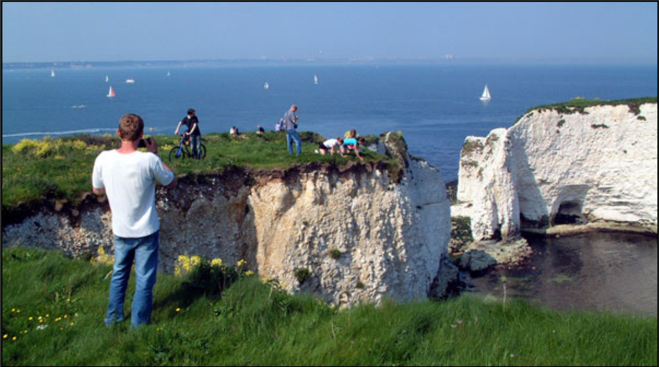
Don't fall - Old Harry Cliffs along the Jurassic coastline of Western England