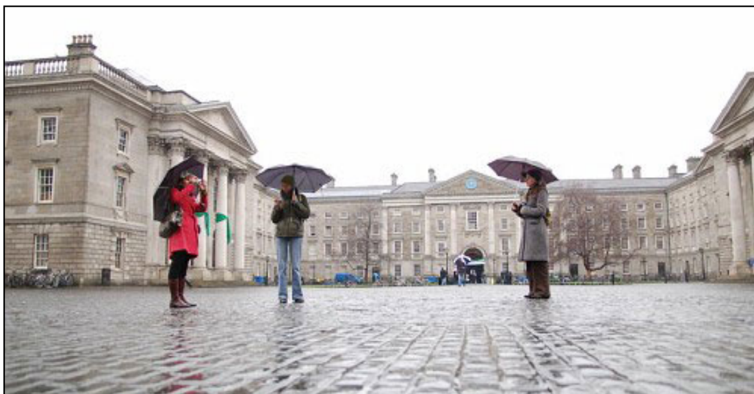
University students in central Belfast

In the early 1990s the Community of the King went through a period of trial and testing, along with a few other communities associated with The Sword of the Spirit . When the community leadership could not agree on a way forward, the community lost many members. In 1995 some 30 former members of the Community of the King, made a commitment together to be a covenant community within the broader Sword of the Spirit network of communities. After a period of prayer and discernment, the community took the name Charis, which is the Greek New Testament word for grace.