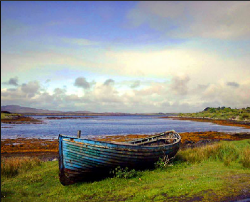
Blue boat by the Irish coast - near Connemara, Ireland