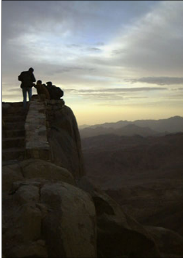
[Pilgrims wait for dawn on Mount Sinai, Egypt]