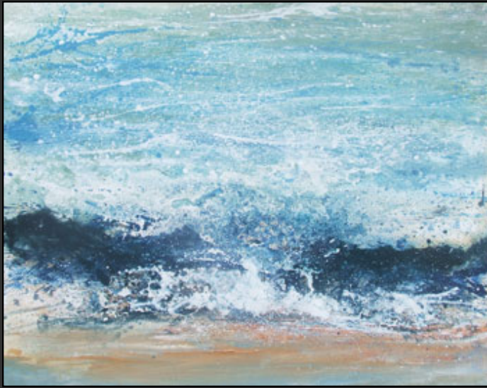
Picture of a Wave