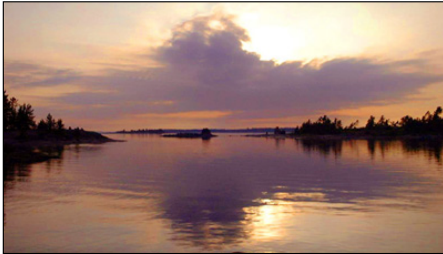
sunset over the Georgian Bay, Ontario, Canada