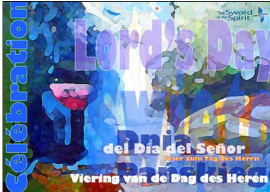
illustration by Jamie Treadwell