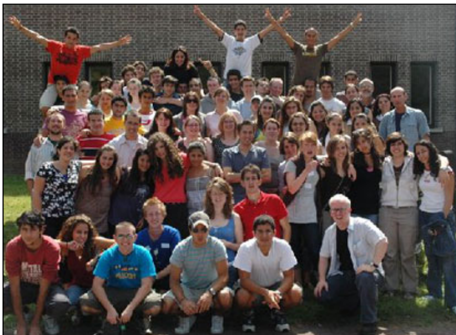
Participants from the Genesis Academy also attended On Holiday