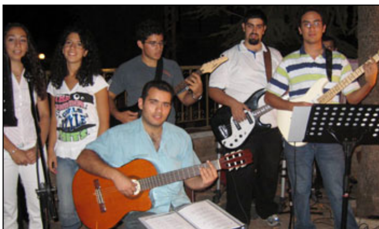
UCO students gather for an evening of song and celebration

The level of commitment and radical discipleship is a striking feature of UCO in such times of trouble. Last year, the number of attendants of the summer mission trip almost doubled (from 30 people to 55) even in the middle of the devastating war that was going on (2,000 dead and more than 10,000 injured). Many challenged the situation — and at times their parents — to be serving God and searching for more of him in their lives. This year even a larger crowd gathered at Theopolis, a Christian Center in Mount Lebanon, to do some hard work of renovation, listen to Christian teaching, and experience shared life together.