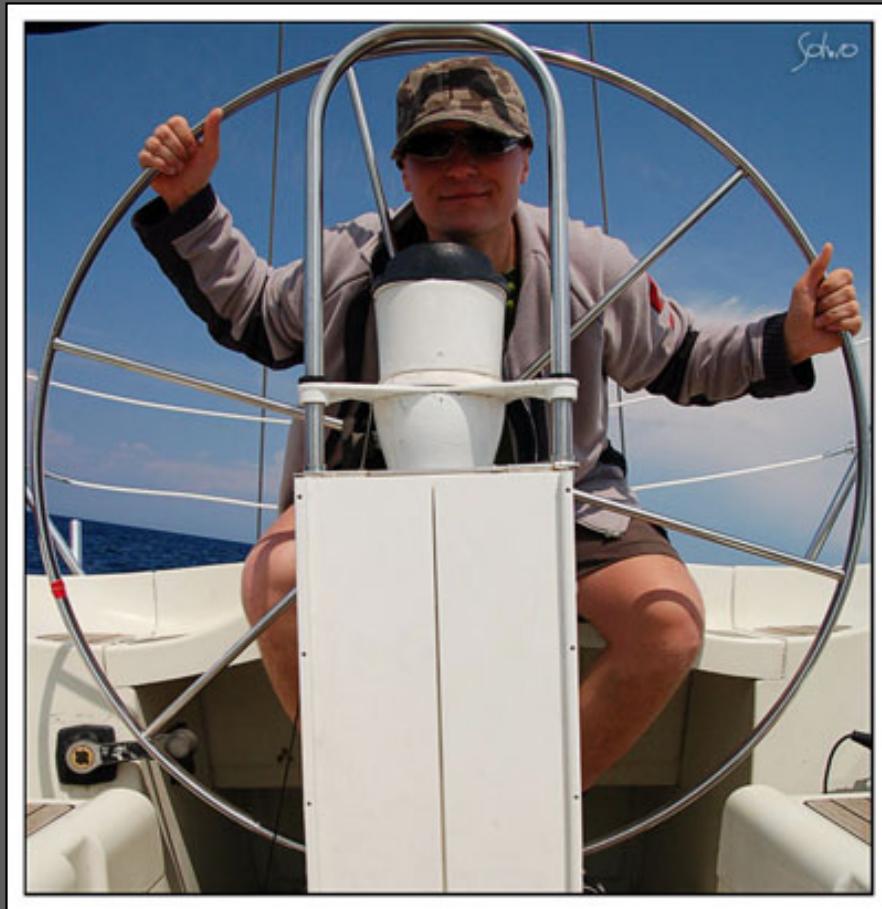
Nautical Da Vinci