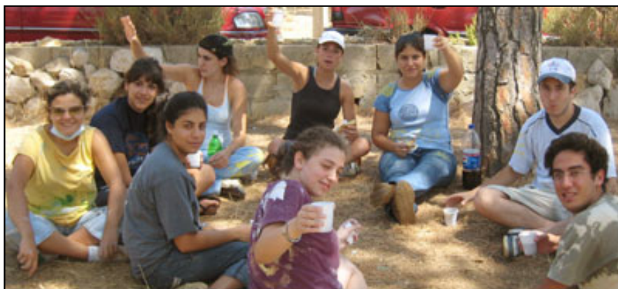
UCO students did volunteer renovation work at the Christian Center on Mount Lebanon

This growth is the fruit of the labor of many brothers and sisters of the community and in UCO in various schools and universities, as well as from the amazing turnout of community children wanting to live the call and the experience that their parents had before them.