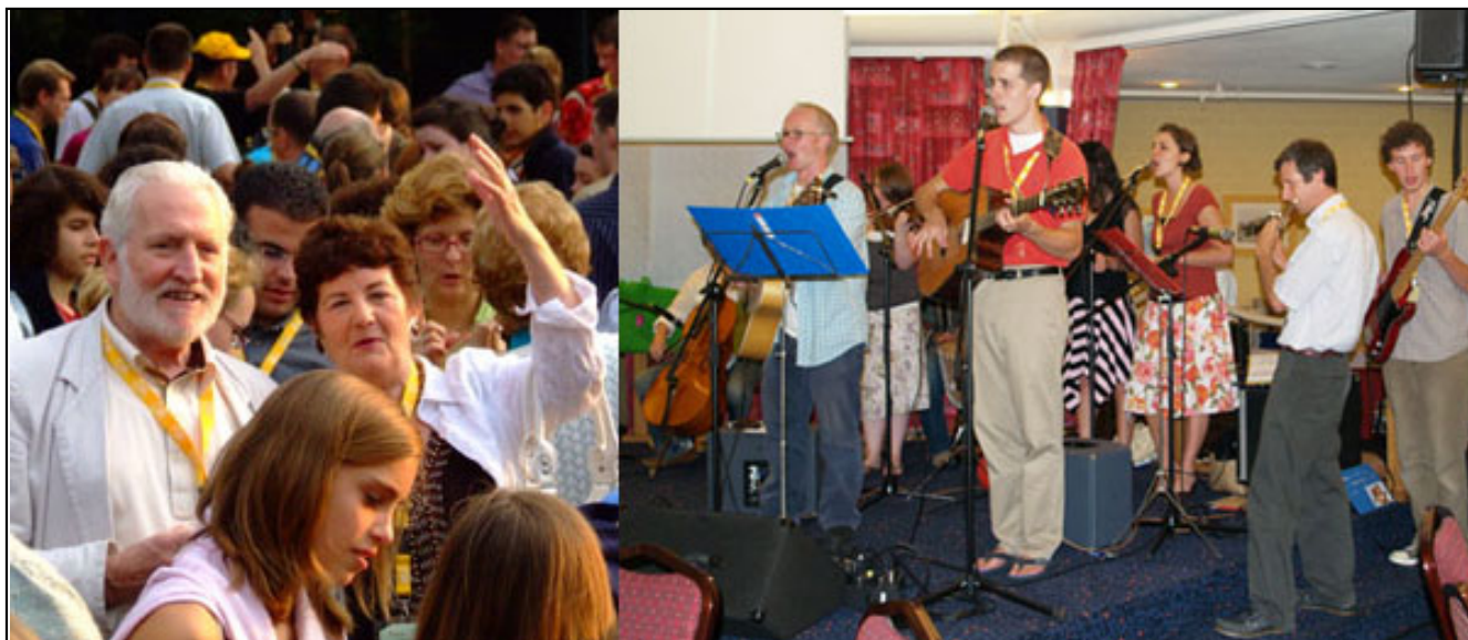
Young and old alike enjoyed rich times of entertainment, fellowship, praise, and singing

Now faith is the assurance of things hoped for, the conviction of things unseen (Hebrews 11:1).