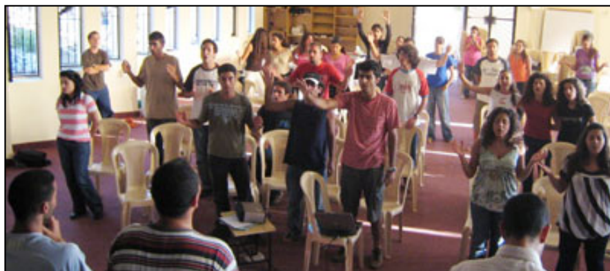
UCO students pray during their mission trip to a Christian Center on Mount Lebanon