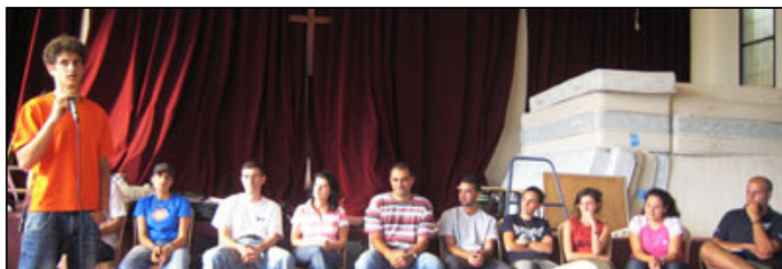
Theme of the August mission trip was on the "Two Kingdoms"