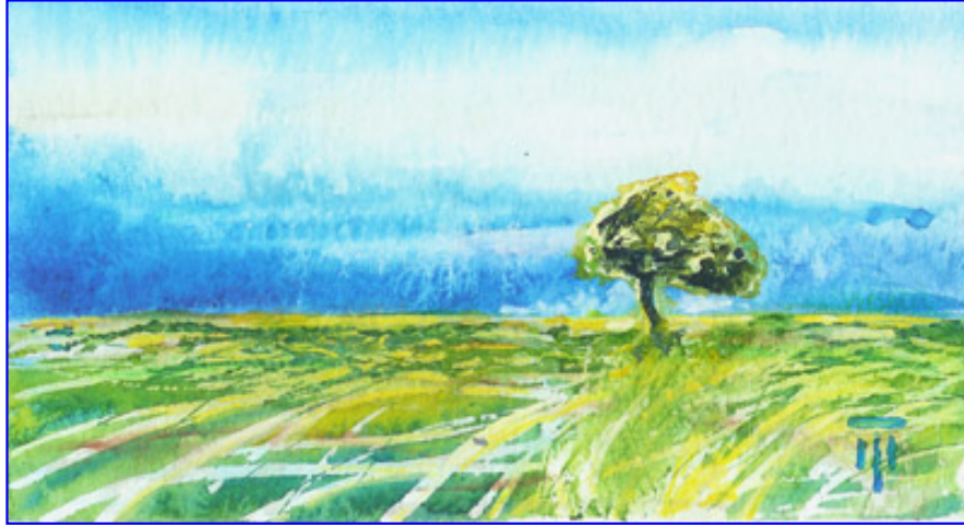
Africa Spring Rain Tree - watercolor by Jamie Treadwell