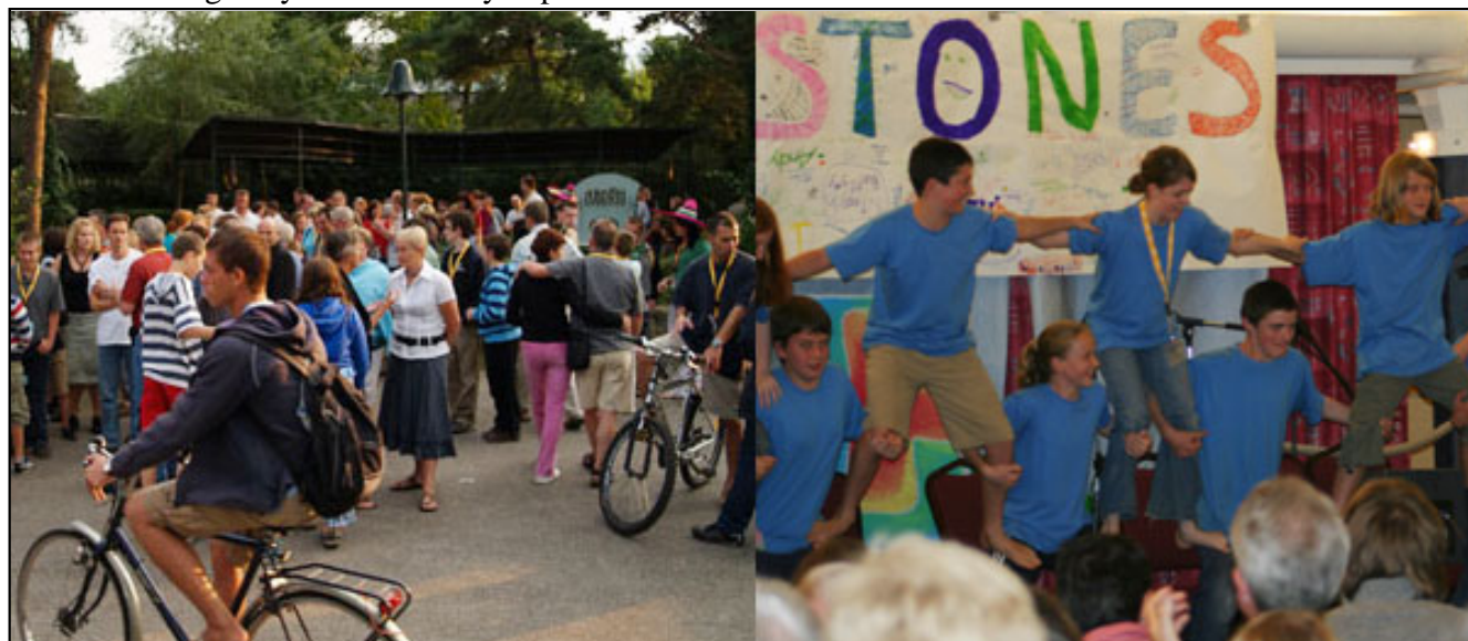
Cars were banned in De Vosseren Park to make way for bicyclists, strollers, roller skaters, boarders, and walkers

I didn't feel as though any of these really expressed what I had felt over the week or what the Lord had been about.