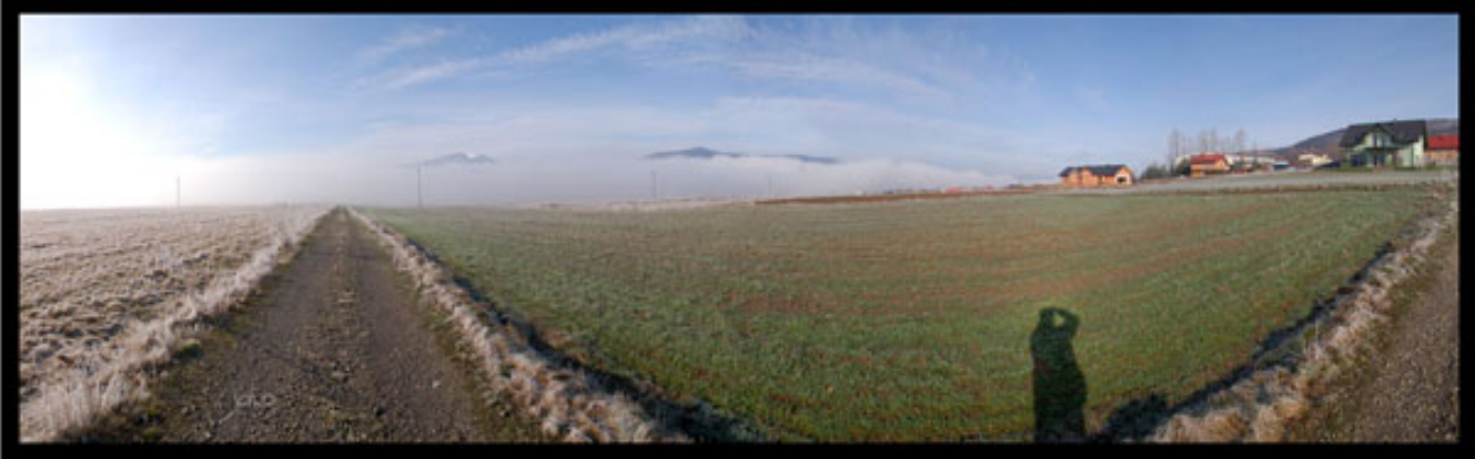
early morning mist rising over the Beskids mountain range in Poland